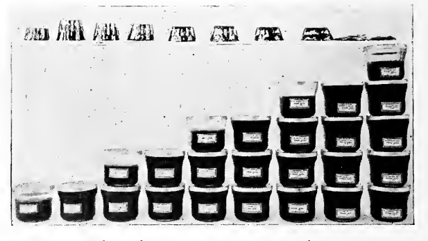
FIGURE 3.—Effect of Increasing Proportions of Sugar on Consistency and Yield of Blackberry Jelly from Unripe Fruit. Left to right: Sugar increasing from one-fourth cup to 21/4 cups per cup of juice

a solution should boil between 103° and 105° C., which is not far from the actual figures as found for good jellies made from jelly stock in the present experiment. Considering the sugar added at the beginning as remaining unchanged in the final product, the percentage of sugar in a jelly can be found by the following formula: